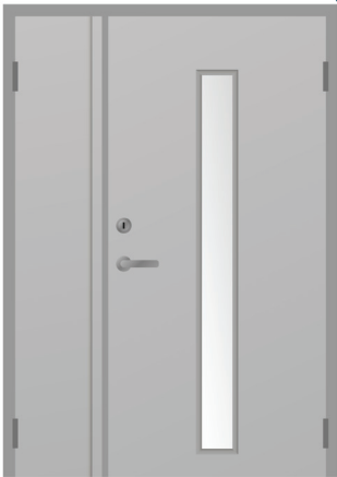
Powder Coated Door